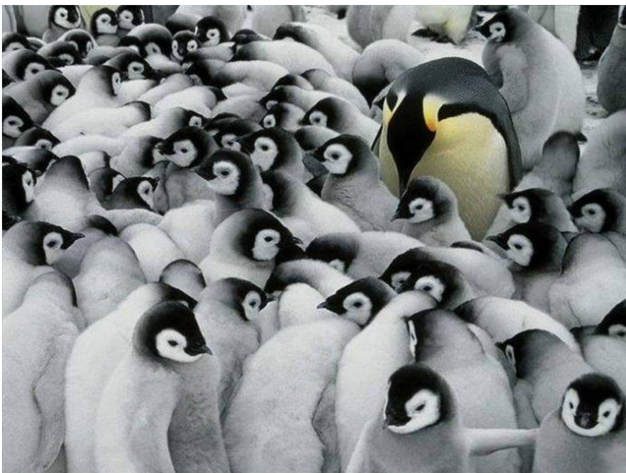
Part 5 SPEAKING