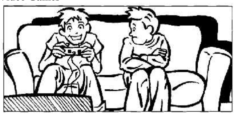
Listen to some teenagers talking about video games. For Questions a -h, TICK (V) THE THINGS THAT YOU HEAR THEM MENTION about video games and PUT A CROSS (X) NEXT TO THE THINGS THAT YOU DON'T HEAR THEM MENTION. You will hear the recording twice.