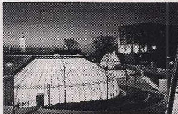
The Castle Mall shopping centre, seen from outside and inside.

Now the city's attractions include another important development, a modern shopping centre called 'The Castle Mall'. The people of Norwich lived with a very large hole in the middle of their city for over two years, as builders dug up the main car park. Lorries moved nearly a million tons of earth so that the roof of the Mall could become a city centre park, with attractive water pools and hundreds of trees. But the local people are really pleased that the old open market remains, right in the heart of the city and next to the new development. Both areas continue to do good business, proving that Norwich has managed to mix the best of the old and the new.