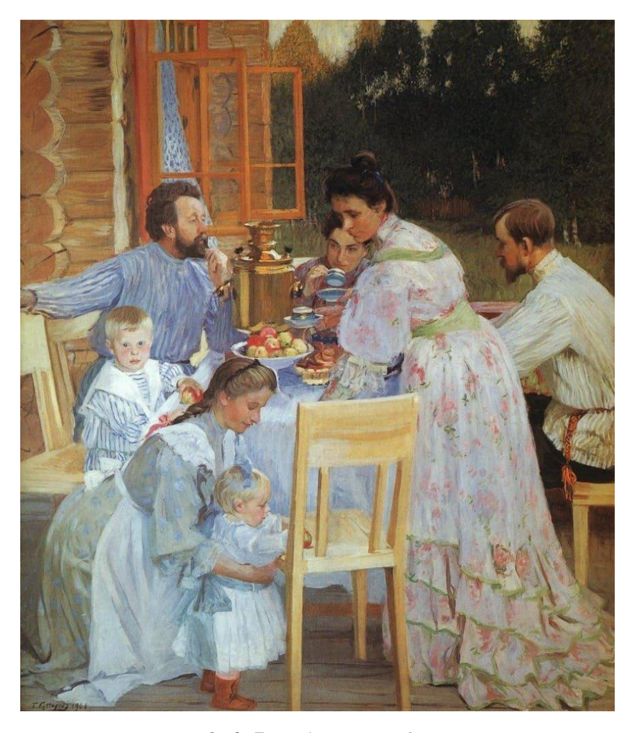
On the Terrace by Boris Kustodiev