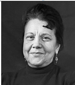
Natalia Konchalovskaya 1903 - 1988