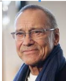
Andrei Konchalovsky 1937-