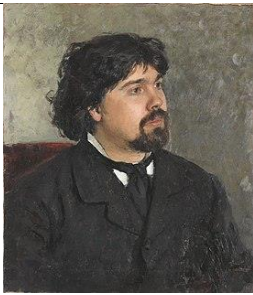
Vasily Surikov 1848-1916