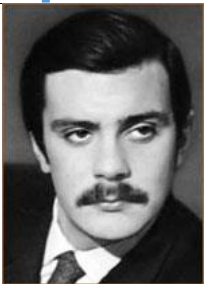
Nikita Mikhalkov 1945 -