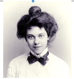
Elena Surikova 1880—1963