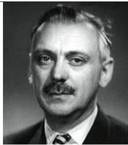
Sergey Mikhalkov 1913 - 2009