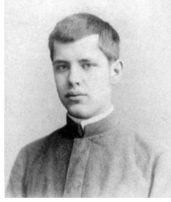
Pyotr Konchalovsky 1876 - 1956